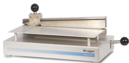
Strip Cutter STR